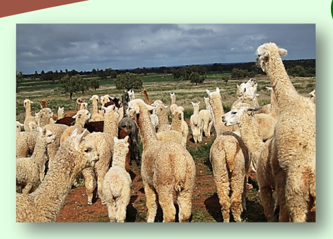
Signature Alpacas Farm & Stud