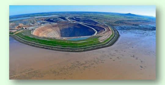
Lake Cowal & Mine