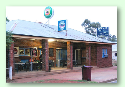
The Burcher Hotel