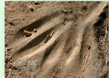
Grooves from rock grindings at Manna Mountain