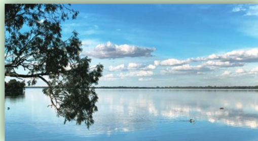
Beautiful Lake Cargelligo