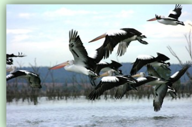
Pelicans at Lake Brewster