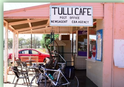
Tulli Café at Tullibigeal