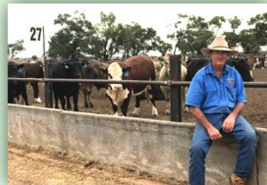
Frampton Flats Feedlot