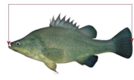
Minimum/maximum length is from the point of the snout to the tip of the tail